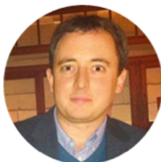
Matt Beedle Engineering